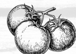
Tomatoes: August-October Greenhouse: April-October