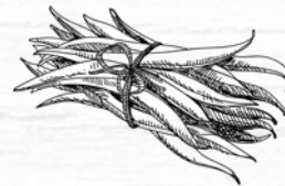
Green & Yellow Beans July-September