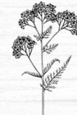
Dill Weed July-August