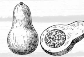
Squash: July-December Ornamental: September-October