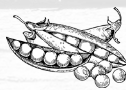
Peas (English) June-Early July