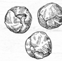
Brussel Sprouts September-December