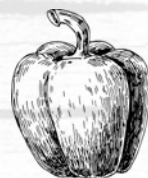
Peppers: July-October Greenhouse: April-October