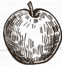
Okanagan Apples August-April