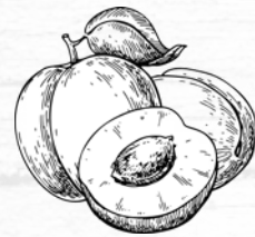
Apricots July-Early August